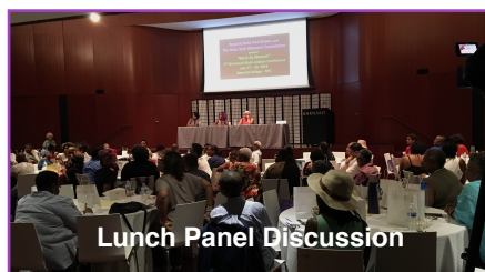
Lunch Panel Discussion